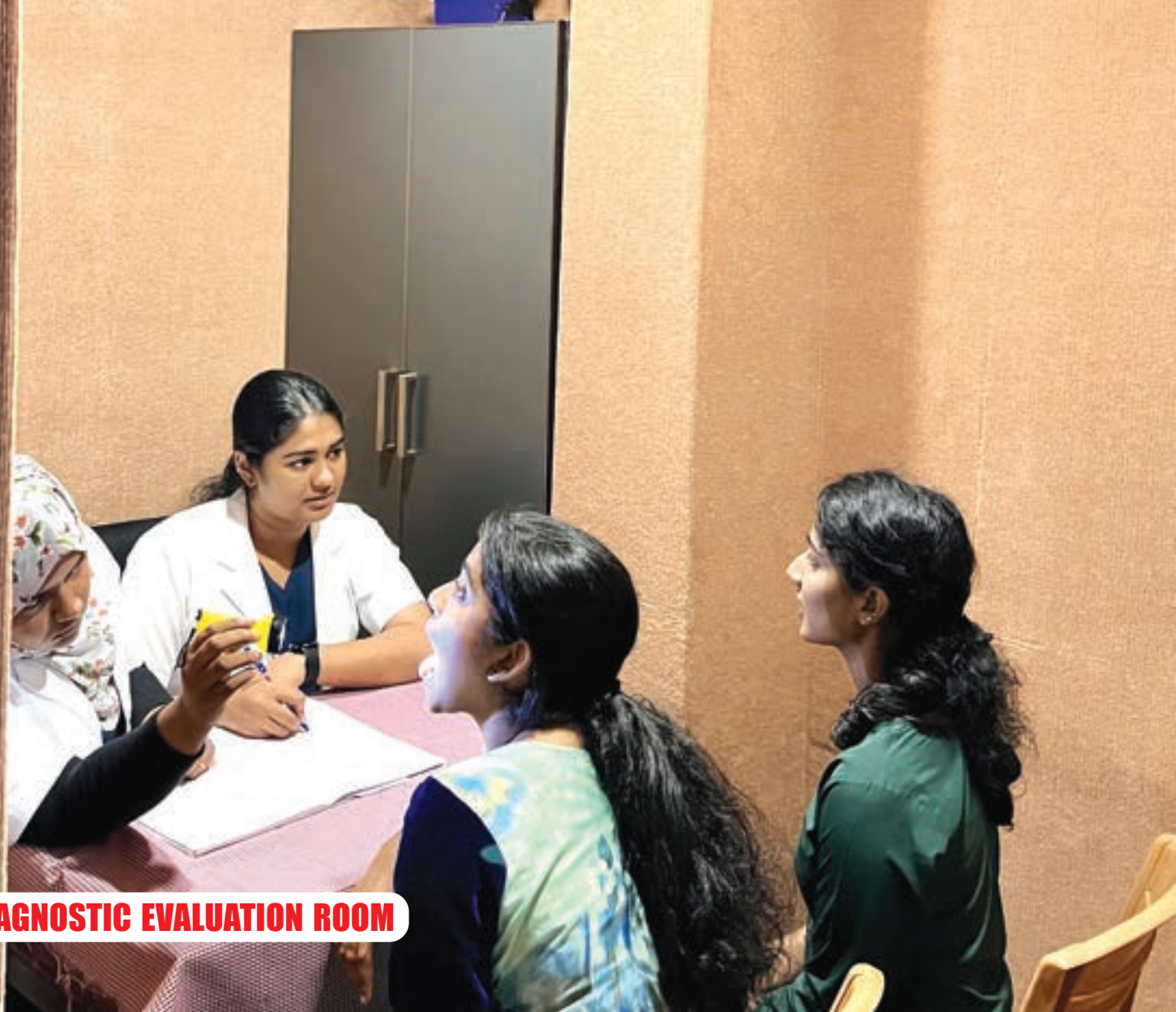
DIAGNOSTIC EVALUATION ROOM